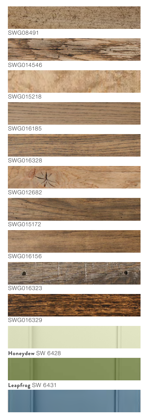
Smoky Azurite SW 9148